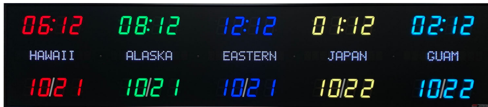
Model 6613H - 2.5" time & date, 10 character - 1.2" zone labels, 5 zones

The 6613 series time zone clocks have user changeable multi-color bar-segment LED time and date displays with a ten character user changeable multi-color dot matrix digital zone label between. In many 6613 models, the clock can display up to 12 time zones through page flipping. For Example, a six zone clock can show two pages of time zone information. Likewise, a four zone unit can show three pages.