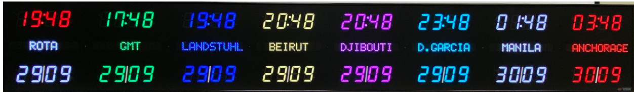
Model 6613R - 2.5" time, 10 character 1.2" zone labels, 8 zones