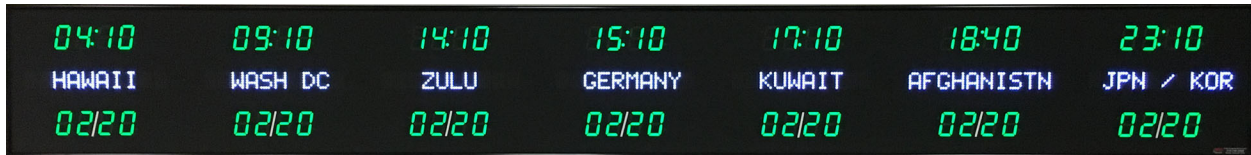
Model 6613N - 1.8" time & date, 10 character - 1.2" zone labels, 7 zones